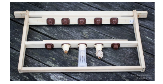
Cell bar frame