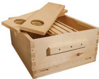
Three way mating nuc. (3x5 frames)