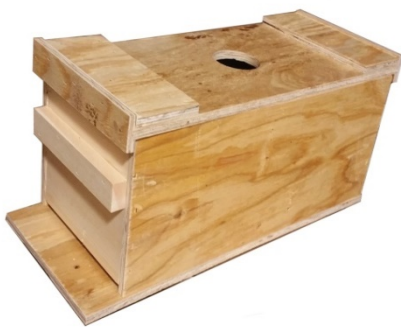
Single mating nuc. (5 frames)