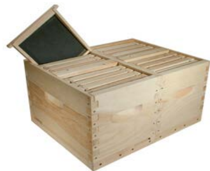
Four way mini mating nuc.

Queen bee's wedding flight, from "More than Honey"